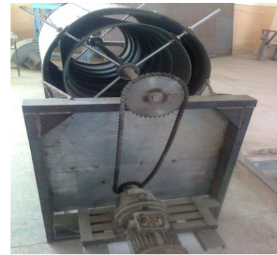
Fig.2. Scheme (left) and photo (photo) of the two-drum washer.

Washing quality with relatively equal size of the drum and the speed of moving the product through the drum of the washing machines is improved by increasing the path of the fruit in the process of washing. On the experimental base of Tashkent State Technical University with positive results were carried out technological tests of the two-drum washing machines of root crops of the proposed design.