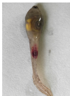
Figure 1 Death symptoms of Q.boulangeri tadpoles in cypermethrin-chlorpyrifos groups.

No dead individuals were found in the tadpoles of Q.boulangeri in the blank group and the activity performance was normal during the experiment. The tadpoles of the Q.boulangeri do irregular strenuous exercise after a few seconds of contact with venom. After a period of time, it was observed that the excrement of the high concentration group was more than that of the low concentration group, and the tadpoles showed a certain adaptability mostly resting at the bottom of the water and some turn over or ventral side up at the bottom of the basin. The death of Q.boulangeri tadpoles in the two test solutions were accompanied by liver enlargement and some of the tadpoles in the butachlor group showed tail bending deformity. The tail of the dead tadpoles in the cypermethrin-chlorpyrifos group showed varying degrees of internal bleeding in the figure 1, while in the butachlor group, there was more slight bleeding in the liver as shown in figure 2.