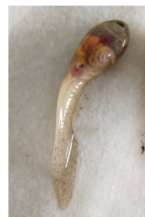
Figure 2 Death symptoms of Q.boulangeri tadpoles in butachlor groups.