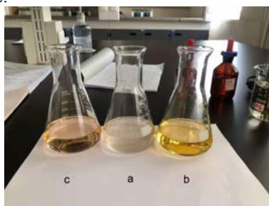
Fig.1. The change in color of a sample during titration.

After sampling, the condenser tube is rinsed with 80% isopropanol solution, and the rinse solution is collected. Using barium perchlorate-thorium reagent to titrate and analyse \text{SO}_4^{2-} concentration in rinse solution, and the \text{SO}_3 concentration in the flue gas was calculated by combining the sampling volume. Fig. 1 shows the color changes of the sample during the titration process in the laboratory. Among a stands for the colorless rinse solution collected after sampling, b stands for the saffron yellow solution with the addition of thorium reagent indicator, and c stands for the pink solution after titration with standard liquid of barium perchlorate.