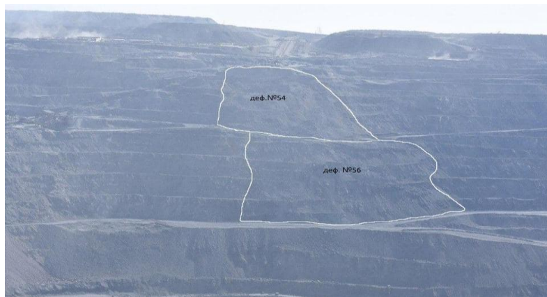
Fig.2. Deformations at the Muruntau quarry deformation contour

The width of transport berms (highways) in quarries varies depending on the number of lanes and the intensity of oncoming traffic, the size of cars and their speeds. In this regard, for heavy-duty vehicles, the width of permanent roads abroad increases to 18-20 m, and in some cases, when they are installed at the exits from the quarry, up to 25-26 and even 30 m (Bingham quarry, USA). In the transverse profile, the width of the roadway increases on curved sections. The transverse slope of paved roads is assumed to be no more than 2%, and the slope of roadsides is up to 4%. But the most important thing is to ensure the stability of transport berms and increase their service life.