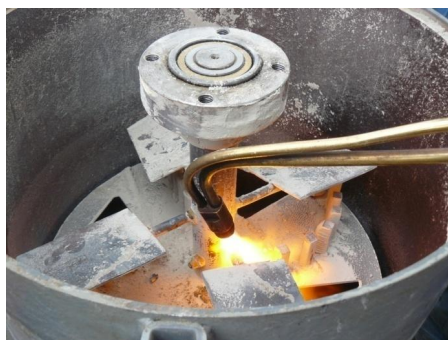
Fig. 2. Varying the number of blades of the propeller design

The variable value during these experiments was the number of airscrew blades. During the experiments, the residence time of the cement in the working zone of the activator, the volume of the activated cement, and the fineness of its grinding were measured. Initially, a two-blade propeller was used. In subsequent experiments, the number of blades was increased to 4 and 6 pcs respectively.