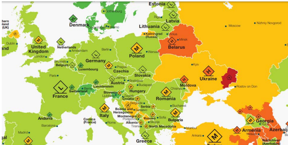
Fig. 2. Riskmap 2021 (a fragment). The forecast of political and security risk for Europe [40].

According to the Control Risks, a specialist risk consultancy, in 2021, Ukraine is forecast as a country with the high political and security risk, with extremal risks on its eastern territories (See Fig. 2).