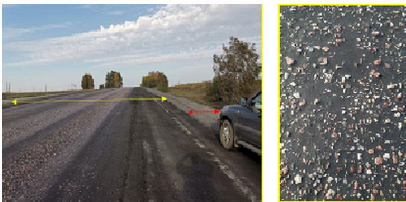
Fig. 5. Treated surface of the technological road JSC "Siberian Anthracite" (Novosibirsk).

Preventive agent "ANTI-DUST" brand D (absorbent) - a complex of active substances for dust suppression and prevention of freezing of rock mass, dirt roads, coal and rock cones in warehouses and tailing dumps. The principle of operation of this tool is to form a bound layer with the material particles and has high performance characteristics. This tool is used at various stages of the production process of mining, storage, processing of coal and other bulk materials, during loading and transportation of bulk materials. The ANTI-DUST agent of the D brand (absorbent) consists of calcium dichloride, special surfactants (including corrosion inhibitors) and water. Special surfactants reduce the surface tension and allow you to cover a large surface of the processed material at the same consumption. Also, the surfactant increases the useful life of the product. Corrosion inhibitors in the composition exclude the negative impact on the metal of technological equipment and gondola cars.