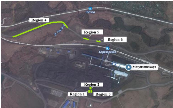
Fig. 4. Situational plan for the location of experimental sites at the Berezovsky mine.

Preventive agent "ANTI-DUST" brand D (absorbent) - a complex of active substances for dust suppression and prevention of freezing of rock mass, dirt roads, coal and rock cones in warehouses and tailing dumps. The principle of operation of this tool is to form a bound layer with the material particles and has high performance characteristics. This tool is used at various stages of the production process of mining, storage, processing of coal and other bulk materials, during loading and transportation of bulk materials. The ANTI-DUST agent of the D brand (absorbent) consists of calcium dichloride, special surfactants (including corrosion inhibitors) and water. Special surfactants reduce the surface tension and allow you to cover a large surface of the processed material at the same consumption. Also, the surfactant increases the useful life of the product. Corrosion inhibitors in the composition exclude the negative impact on the metal of technological equipment and gondola cars.