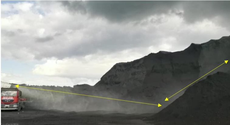
Fig. 1. Processing of the coal warehouse of the Raspadsky mine with the SPD-90 dust suppression system. The direction of the fog flow is as far down as possible. The range is 90 meters. The fog rises on top of the coal stack, which indicates a high-quality atomization of the fine phase.

In 2019-2020, employees of the Engineering Company "BRENT" and the Kuzbass State Technical University named after T. F. Gorbachev conducted industrial tests of the preventive agent "Anti-dust" [7]. With its help, the developers intend to reduce dusting during loading and unloading, transportation, technological sorting and storage of bulk materials at the coal enterprises of Kuzbass (Berezovsky and Mine No. 12 of StroyService JSC, Kedrovsky mine of Kuzbassrazrezugol JSC, Raspadsky mine of RUK JSC), Khakassia (Chernogorsky mine of SUEK JSC) and Novosibirsk region (Siberian Anthracite JSC).