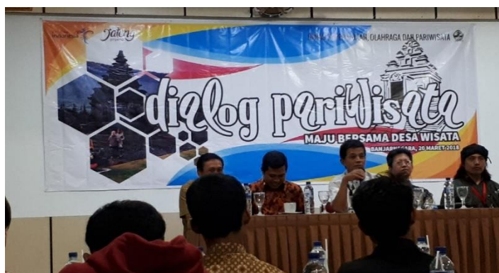
Fig. 5. Pokdarwis dieng pandawa vlog dialogue with the department of tourism and culture.

The organizer and tourists conducted a question-answer presentation about the Dieng Plateau tourist attractions by gathering several stakeholders such as the tourism bureau.