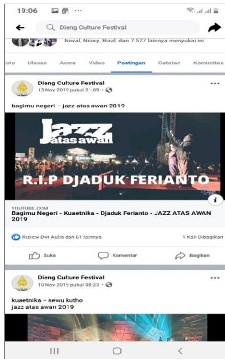
Fig. 7. Facebook of the dieng culture festival.