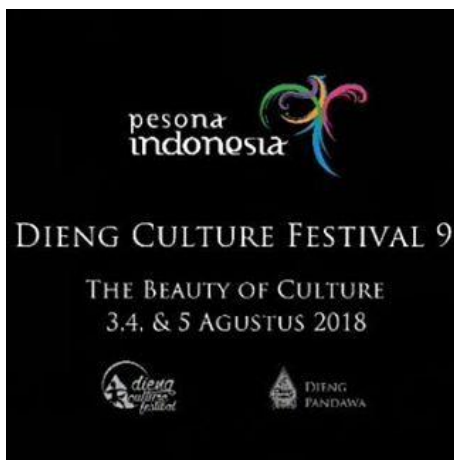
Fig. 3. Dieng culture festival billboards.

The billboards contained the logo of the 2018 DCF. The billboards were placed in several strategic places and installed long before the event was held to inform the public.