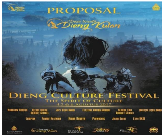
Fig. 1. Dieng culture festival booklet.

The DCF organizer made booklets for tourists. The booklets were printed before the event was held. The booklets were book-shaped sheets containing information on several tourist attractions in the Dieng Plateau. These booklets were distributed to tourists visiting the Kailasa Museum in the Dieng tourist attraction area to provide a stunning impression by seeing ads on the bottom line.