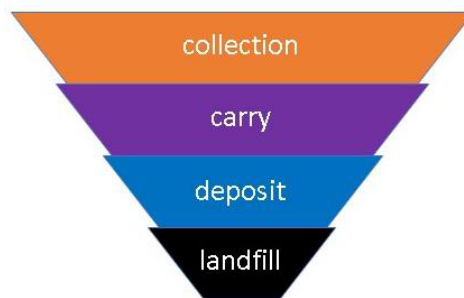
Fig 2. waste management strategy in East Timor.

In the absence of a reliable management strategy in managing waste, it can be concluded that the people in the capital city of Dili still use the classic handling methods in managing waste. A system includes waste collection, transportation, and throwing it away in the place provided without good sorting [12]. This classic waste management system also influences the mindset of the people of the capital city of Dili. The people make themselves the ones to be served by the government. The cleaners of the city of Dili transport the waste that is dumped at every TPS (temporary collected waste).