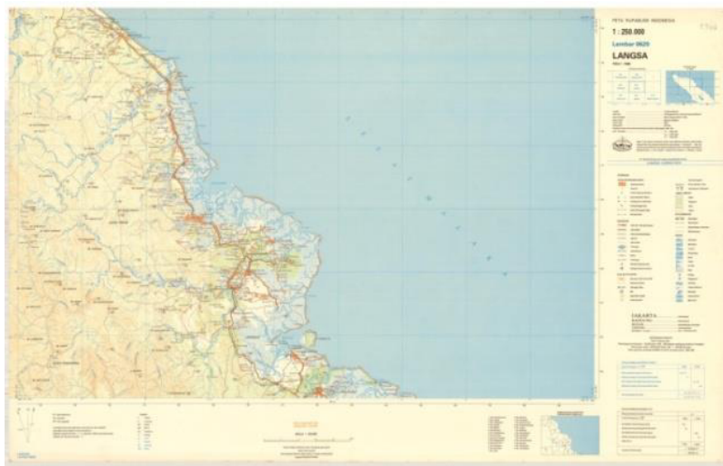
Fig. 2. Indonesian Topographical Map - Langsa by ANRI 1: 250.000, 1987.