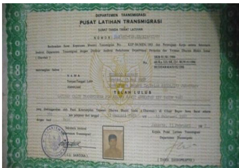
Fig. 3. Certificate of Training given to Would-be Transmigrants who were to be sent to Pir Sus II Aluer Punti Langsa, East Aceh.