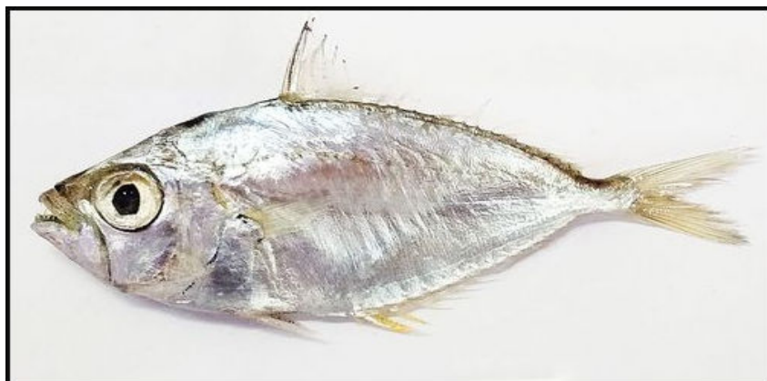
Fig. 2. Toothpony, Gazza minuta (Bloch 1795)[20].