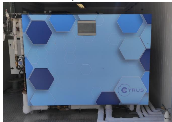
Fig. 5. Metal Hydride Compressor

For the automation of the compression and of the station's function in general, the installation is monitored and controlled by a PLC unit. By monitoring the system's status constantly (temperatures and pressures of the complete gas network), the controller ensures the smooth operation of the installation at all