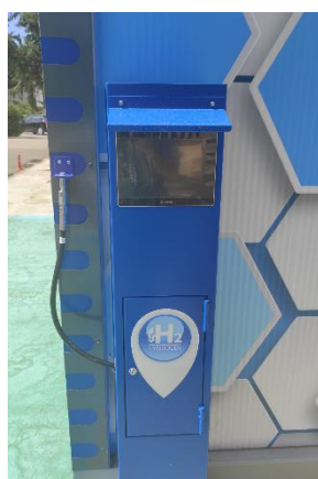
Fig. 7. Hydrogen Dispenser

One of the reasons that the installation can have such a smooth function lies in the nature of hydrogen as an energy storage medium. It is obvious that the fluctuations in the electrolysis operation which are due to the fluctuations of the solar irradiance can be