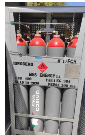
Fig. 4. Hydrogen storage tanks