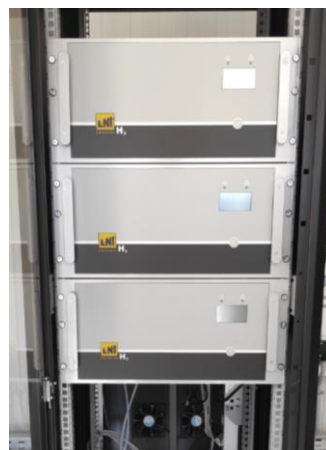
Fig. 3. Electrolysis Stacks

The compressor technology used in this case is the Metal Hydride compressors (MHC). MHCs base their operation on the property of metal hydrides of absorbing/desorbing hydrogen depending on their temperature, thus they are classified as thermal compressors. Compression is achieved by a reversible heat-driven interaction of a hydride forming metal or alloy or intermetallic compound with hydrogen to form MH. Since their operation is based on thermal