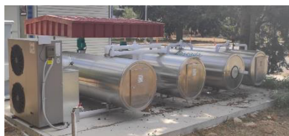
Fig. 6. Hot and cold water tanks and pumps for the compressor operation

times. The automated function of the compressor is ensured by the control unit and an algorithm of successive phase transitions. The system begins to operate only when the temperature transmitters inform the controller that the water temperature is in its pre-specified temperature. The controller then, basically switches on and off the appropriate valves which regulate the flow of water and when they are at the correct state (open or closed), it gives a signal to the pumps to start operating. The system then runs for the