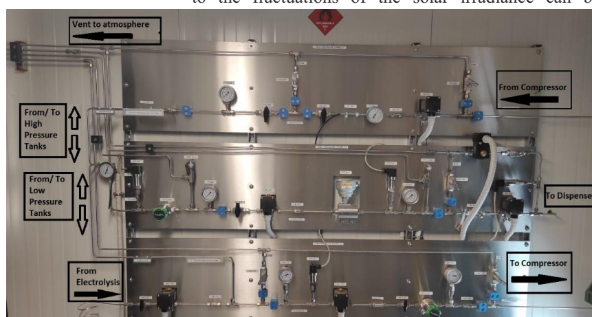
Fig. 7. Gaseous Network Panel. Top to bottom: High pressure panel, Dispensing panel, Low Pressure panel