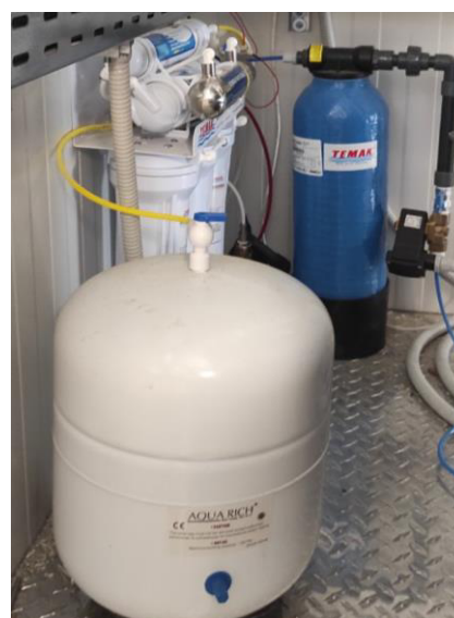
Fig. 2. Water Treatment

Water quality is an important aspect of a PEM electrolyzer's function and the threshold in which it can operate is strictly determined by the manufacturer. The most important characteristic for the water used in PEM electrolysis is its high resistivity, which is achieved by low content in contaminants such as electrolytes, ions, sodium and chlorides. Such contaminants are removed in the water treatment unit by filtering and deionizing water by using mixed bed resins and carbon filters. Also in order to desterilize water a UV lamp is used, which kills bacteria and microorganisms. The water which has passed though the treatment unit enters the electrolysis with an electrical conductivity lower than 0.1\mu\text{S} and concentration of sodium and chlorides lower than