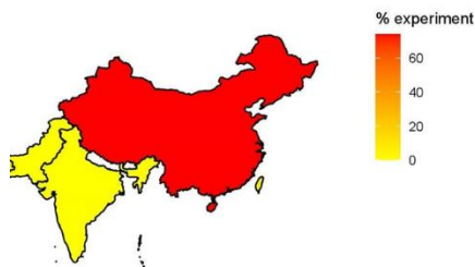
Fig. 1. Actual and estimated of the edible bird nest exported from Indonesia on countries origin target. (Figures are belong to author itself).