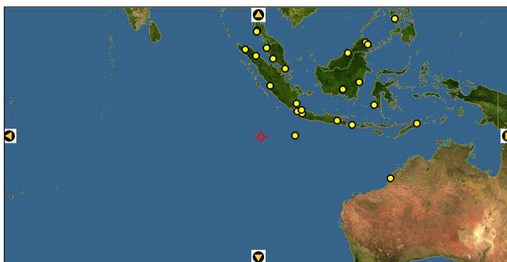
Fig. 3. Pin point view of Aerodramus fuciphagus , the dataset are Indonesia countries.

Map center: NAD83 Lat-long 10.5°S 99°E; UTM 47 500000E 8839306N Resolution 0.125 degrees/pixel, Target 10.2°S 99°E. Source [17]