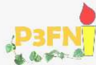
Indonesian Society for Functional Food and Nutraceutical (ISFFN/P3FNI)