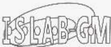
Indonesian Society for Lactic Acid Bacteria and Gut Microbiota (ISLAB-GM)