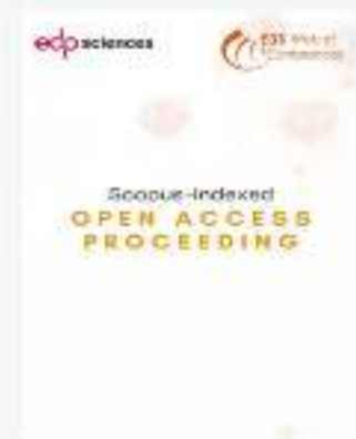
E3S Web of Conferences