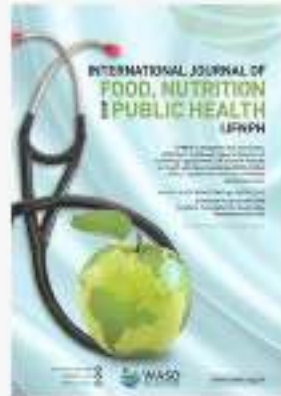
International Journal of Food, Nutrition and Public Health