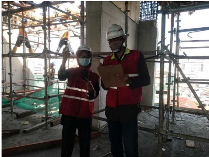
Fig. 2. The first method of measurement

The sound level meter is used to measure the pressure level of transitory sound dB(A) for 10 minutes for each measurement. As a result, the surveyor obtains up to 200 pieces of data which represent certain time intervals.