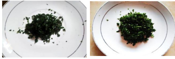
Fig. 4. The result of chopped leaves katuk and spinach