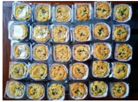
Fig. 9. Serving (output)