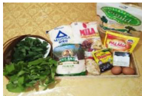
Fig. 2. Procuring of foodstuff.