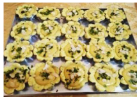
Fig. 7. Filling of brownies dough to tartlet and giving a topping