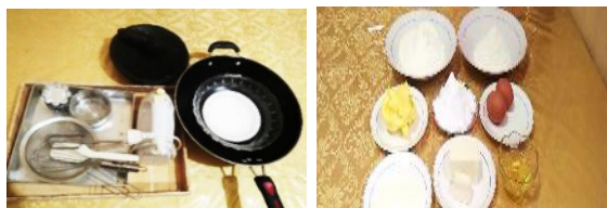
Fig. 3. Preparing of tools and ingredients