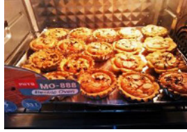
Fig. 8. Process of baking