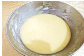
Fig. 6. Brownies