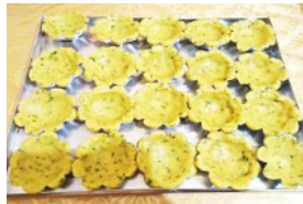
Fig. 5. Tartlet