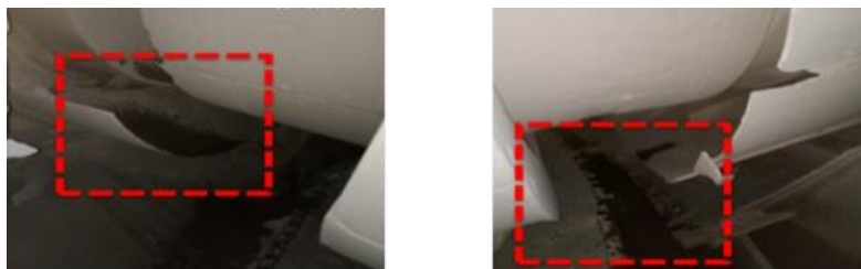
Fig. 3. Oil spill in the raw mill area before and after the installation of the Split-type oil seal

When we talk about hazardous waste, we need to be concerned about the oil spill [8] which happens in the Vertical Mill Roller 6R1M01 equipment. Oil spill could potentially trigger further waste management spillovers in the Raw Mill equipment located in the Indarung VI, which is mainly caused by a non-durable seal that is used to cover over the equipment. Therefore, the company needs to modify the equipment's seal, from using the Chesterton Seal to shifting to using the Split-type oil seal, which is more durable and stronger, thus could prevent spillovers (seen in Fig. 3).