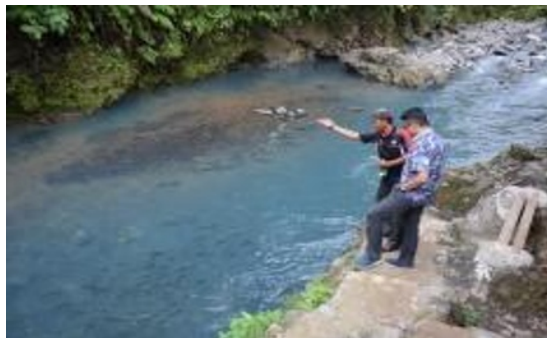
Fig. 7. The ecotourism activities of the Lambung Bukit community

Semen Padang company is attempting to involve locals in its corporate social responsibility programs, based upon the shared value principle, which can benefit both people as well as their surrounding environment. The Lambung Bukit community's ecotourism program is done by maximizing the potentials of the Batu Busuk natural panorama, which features crystal-clear, blue-colored rivers, supported by beautiful surroundings (see Fig. 7).