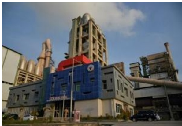
Fig. 1. Semen Padang's factory is the oldest cement factory in Indonesia since 1910

This paper measures the contribution of Semen Padang both to energy management and the operational environment during the pandemic, and also to the management of medical waste from various health facilities in Sumatra island to prevent environmental pollution and the spread of advanced diseases. In addition, there is also support for community empowerment in facing the COVID-19 pandemic to help individuals in surviving these difficult times. Semen Padang, has an operational base in Padang, the capital city of West Sumatra (see Fig. 1), established in 1910 as the first cement factory in Southeast Asia [1].