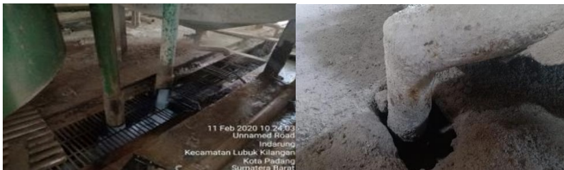
Fig. 5. Changes brought by the water efficiency program before (left) and after (right) the valve has been closed in the Indarung 2/3 factory water channel

The company conducts its water efficiency program by flowing water through the force of gravitation from a high place (the Gas Conditioning Tower - GCT tank) to a low place. The company has also been optimizing its water efficiency programs by shutting the valve of its idle (non-active) equipment in its Indarung 2/3 factory (Fig. 5).