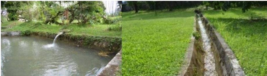
Fig. 6. A modified pool for ikan bilih breeding purposes in the Semen Padang compound

The Mystacoleucus padangensis Blkr. Fish, called the ikan bilih using the local language, is a fish species endemic to the Singkarak lake. Entering this decade of the 2000s, the endemic fish population has started to decline due to non-selective catchment activities utilizing destructive catchment tools, which has caused more harm to the fish population. Semen Padang also attempts to conserve the endangered fish species by breeding the species ex-situ in a different habitat, before returning to their original habitat (see Fig. 6).