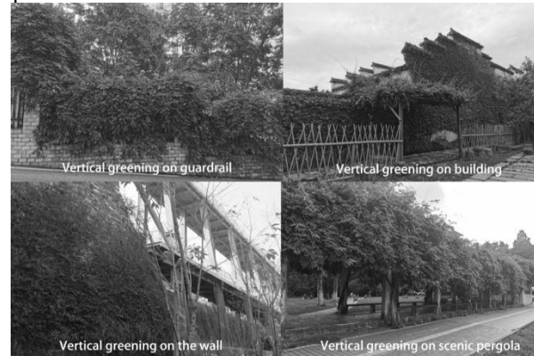
Fig. 3. Different forms of vertical greening.

unit leaf area is 6.91 \text{g}\cdot\text{m}^{-2}\cdot\text{d}^{-1} ), etc., which proves that vertical greening has good carbon sequestration potential [28-29]. There are also studies to establish a vertical greenery ecosystem carbon dioxide sequestration calculation model. Using Zoysia Matrella , Salvia Nemorosa , Geranium Sanguineum and other plant materials, the average annual carbon dioxide uptake of plant biomass was estimated to be 0.44-3.18 \text{kg CO}_2\text{eq m}^{-2} , demonstrating the advantages of vertical wall carbon fixation [30]. Therefore, increasing vertical greening becomes one of the ways to improve the ecological benefits of carbon sequestration of green space.