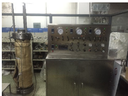
Fig 1 Experimental device for cement sheath sealing in borehole annulus

analyzed by evaluating the fluid flow in the simulated formation.