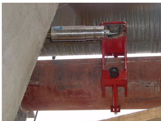
Fig. 5. Installation drawing of pipe damper of No. 19 support and hanger.

(2) The stress analysis results of the pipeline in the hot section of reheat steam show that the primary and secondary stresses of the pipeline system meet the standard requirements, and the installation of limit device and hydraulic damper has no impact on the stress of the pipeline system.