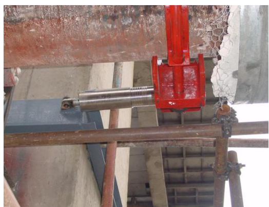
Fig. 4. Installation drawing of pipe damper of No. 7 support and hanger.