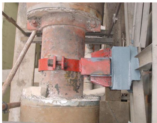
Fig.2. Site installation drawing of No. 10 support and hanger limit.

The effect pictures of the pipe section of No.10 support hanger and No.22 support hanger in the Z direction (pipeline axial direction) after installation are shown in Figure 2 and Figure 3. The effect pictures of the pipe section of No.7 support hanger and the axial damper section of No.19 support hanger are shown in Figure 4 and Figure 5.