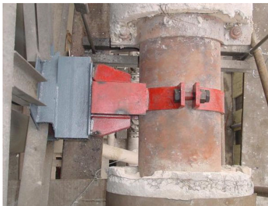
Fig. 3. Site installation drawing of No. 22 support and hanger limit.