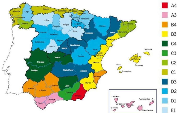
Fig. 1: Distribution of climate zones in Spain [6]

In Spain, a country zoning on twelve climatic zones have been adopted based on a climatic “severity” defined taking into account the degree-days and the annual solar radiation in the zone 3 . In addition, within each of these twelve zones, there may be sub-climatic zones depending on their altitude regarding the one of the region city capital. While in Morocco, it has been decided to establish a zoning that is the result of a dynamic simulation of a unique standard building carried out considering several Moroccan localities climate conditions using the Trnsys Software 4 . Consequently, six different climatic zones have been defined throughout the country where, relevant differences in term of annual heating and cooling needs have been observed