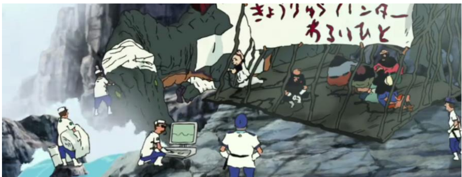
Fig. 4. The group of hunters has been caught, there is a label that says "dinosaur hunters are criminals.