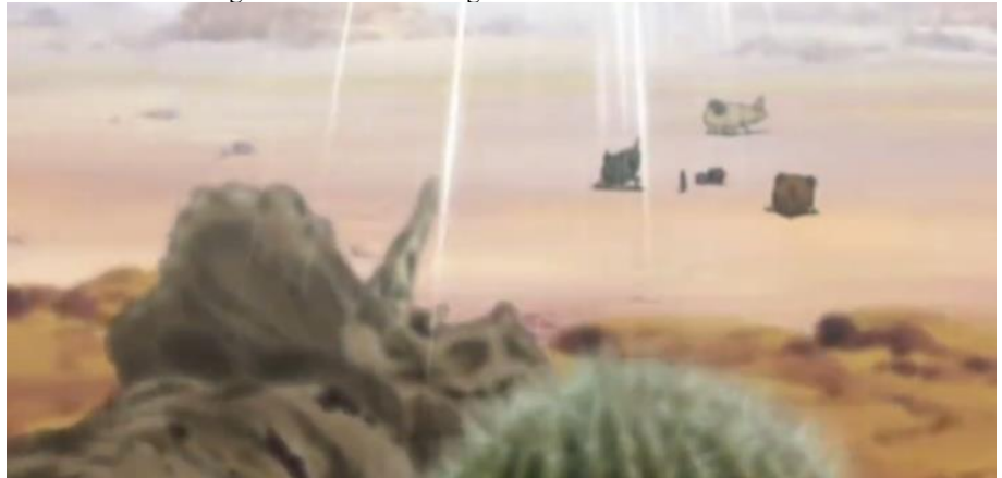
Fig. 2. Areas that have become arid due to pollution, and the carcasses of dead dinosaurs.