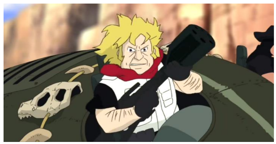
Fig. 1. Rifles used for hunting dinosaurs and hunting vehicles