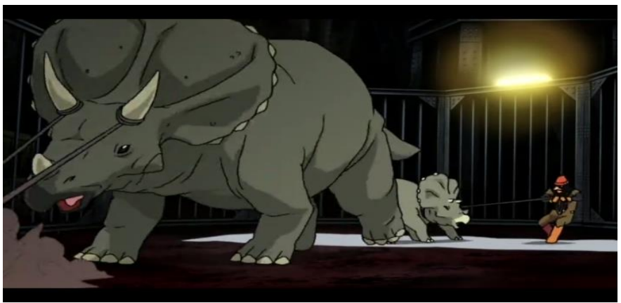
Fig. 3. Some of the dinosaurs that have been caught are separated from their mothers

In addition, another form of criticism conveyed is the mindset of the hunters who catch their prey in excessive numbers. In the movie, the group of hunters feel that it is okay to catch a few hundred dinosaurs because there are still many in the wild. It would be very dangerous if this mindset were shared by everyone. This can cause the extinction of living species.