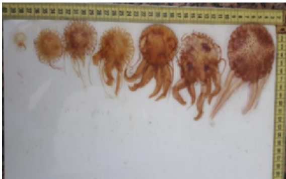
Fig. 9. Pelagia noctiluca