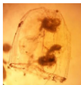
Fig. 7. Persa incolorata