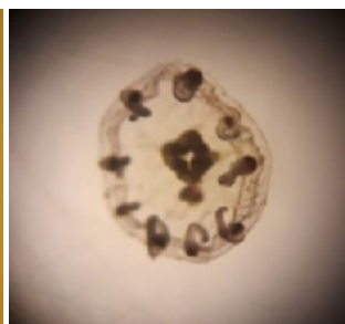
Fig. 3. Mitrocomella brownei (personal photo)