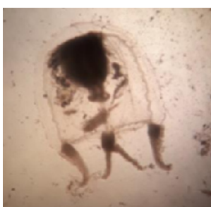
Fig. 6. Zanella sessilis