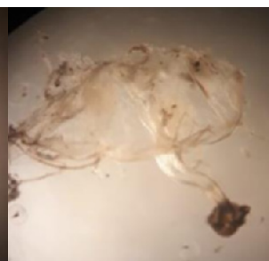
Fig. 5. Geryoma proboscidalis