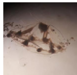
Fig. 8. Pantachogon militare (Personal photo)

The Scyphomedusa class is represented by two species, Pelagia noctiluca (Figure 9) which is the most common species in the Mediterranean, it has reached bloom densities, and the diameter of the umbrellas of the fished species varies between 3cm (young jellyfish) and 8cm (adult). The second species is Rhizostoma Pulmo (Figure 10), the latter