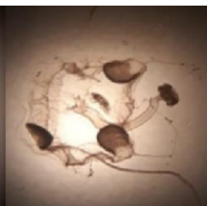
Fig. 4. Liriope tetraphylla