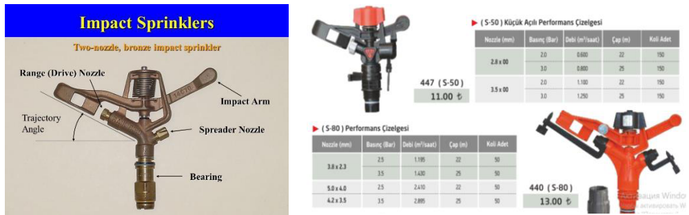
Fig 4. Types of sprinklers according to parameters

Selection of sprinklers. Sprinklers are divided into several types according to discharge and time [Fig 1]. Water consumption is divided into several types according to row spacing and other parameters. The Sprinkler type is selected according to the above parameters.