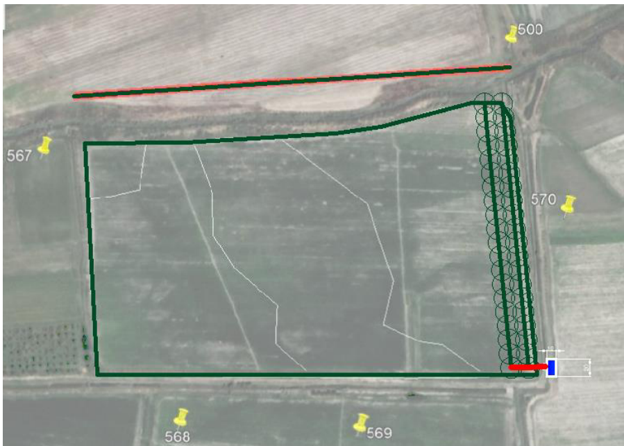
Fig 3. Divide the area into sections in AutoCAD