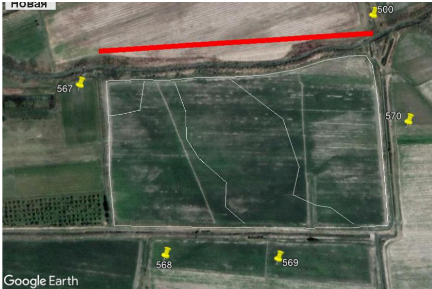
Fig 2. Spatial image of 8 hectares in the Tashkent region of the Republic of Uzbekistan from the program "Google Earth"

Study the map of the area. Using the functions of Google Earth and AutoCAD, the area map is studied in terms of altitude. To do this, the area is searched, and marks are made according to its slope. This image is then transferred to AutoCAD, and the field parameters are set according to the scale [Figure 2].