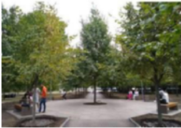
Fig. 2. “Monument to a tree” located at the Don State Technical University park.

This object is shown in Figure 2, the “Monument to a tree” in the Don State Technical University park was made with passion and respect for the creation of nature: a tree as a representative of the world of plants, giving people clean air, shade in the heat, visual comfort, fruits and much more.