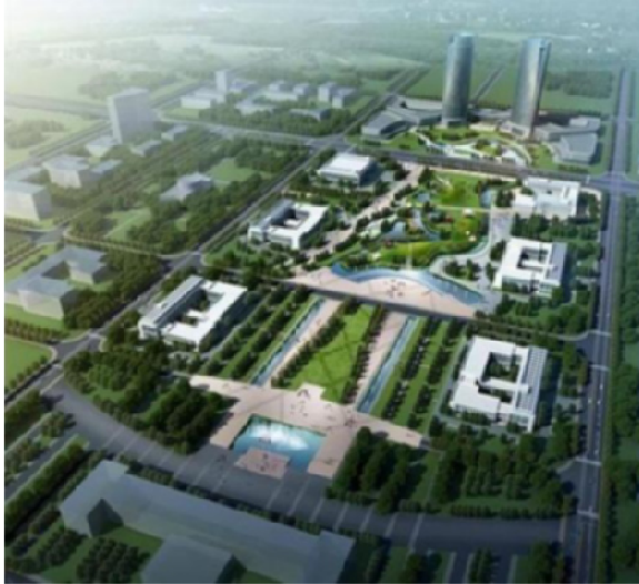
Fig. 1. Outdoor exhibition landscape of modern architecture.

professionally executed design and works of art or other types of creativity contribute to the successful formation of a creative person in their positive development.