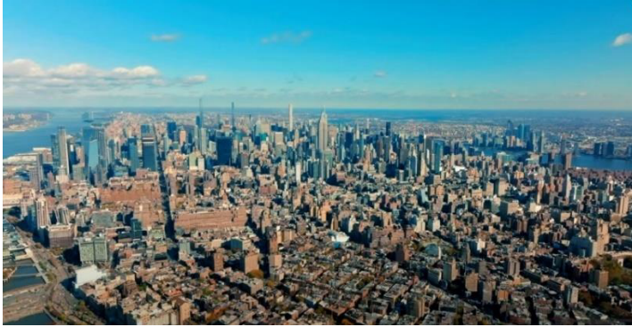
Fig. 1. Color range of New York.

Another thing is cities as a man-made environment for normal living. The very different conditions in which a particular city appeared, predetermined the architecture, the face of the city. Local conditions, traditions, technologies, and building materials have generated very specific city-planning formations. [5-8] For example, white and blue Santorini. Ochre and brown shades predominate in New York (Fig. 1,2).