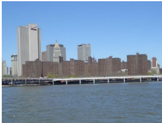
Fig. 2. New York. East River Quay.

Swiss Bern is peculiar in its color scheme, where most of the buildings located in the historic center have an olive shade (Fig. 3). The color choice of urban public transport acts as a contrast to it. The tramcars and buses have a complex crimson-cherry red shade in combination with the “olive” city (Fig. 4).