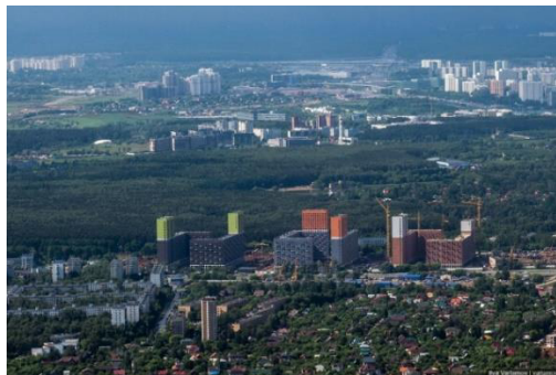
Fig. 6. Post-perestroika development of New Moscow.

In the current situation, yearning for the power of the color impact, Moscow has turned sharply towards polychromy. The boundary is seen very clearly between the white-stone areas of the pre-perestroika period and the polychrome development of the post-perestroika period (Fig. 6).