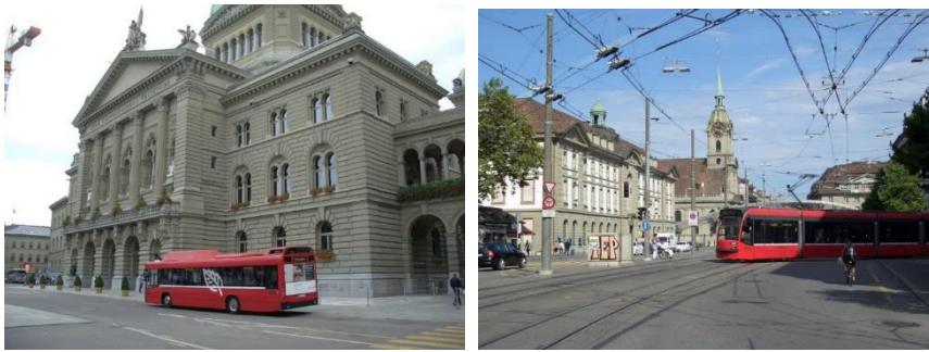
Fig. 4. Color of public transport in Bern.