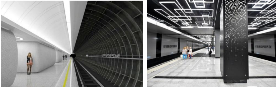
Fig. 14. New stations of the Moscow Metro.