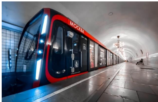
Fig. 13. New model of the metro train “Moscow 2020.”