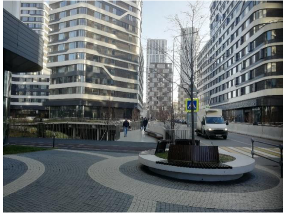
Fig. 8. “Ostrov” Residential Complex on NizhnieMnyovniki Street.