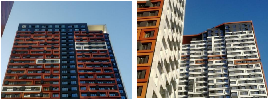
Fig. 9. “Simvol” Residential Complex.

And the last trend is due to the fact that some construction companies build absolutely lapidary boxes of residential buildings, which are devoid of any architectural details. Moving away from monotony is achieved by creating the optical illusions of facade three-dimensionality with the active introduction of black color, sometimes even in aggressive combinations, such as black and yellow, which is used to designate dangerous areas (Fig. 10).