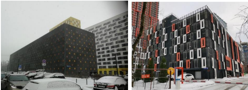
Fig. 12. Car parks in the residential development of Mytishchi and “Ogni” Residential Complex in Ramenki.