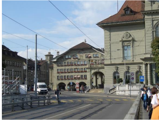
Fig. 3. Color range of Bern (Switzerland).