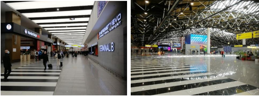
Fig. 11. New terminal “B” of Sheremetyevo Airport.

In general, it should be noted that the black color is a peculiar trend at the present time; besides the architecture of residential and public buildings, it actively proves itself in various sectors of life (Fig. 12, 13, 14, 15). There is plenty of it in the new terminal “B” at Sheremetyevo Airport (Fig. 11), in the new metro stations of recent times Savelovskaya, Rizhskaya (Big Circle Line), Govorovo; the photos of car parks are shown (Fig. 12); currently, the metro trains themselves of brand-new models and even a baby stroller can be absolutely black (Fig. 15).