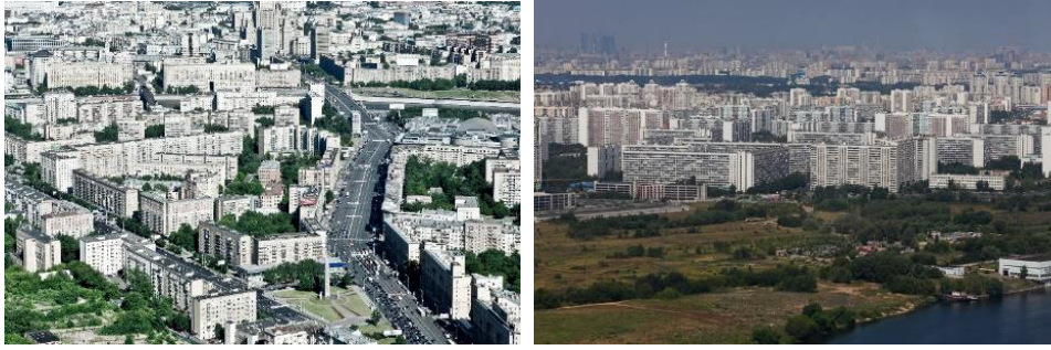
Fig. 5. White-stone Moscow.

To some degree, this can be explained by the inertial movement: as it was white-stone, so it remains the same. It is partly due to natural conditions, when the city lacks light and sunshine. In some way, it can be attributed to cultural traditions: in Russia, light colors were always associated with higher standards of living and way of life.