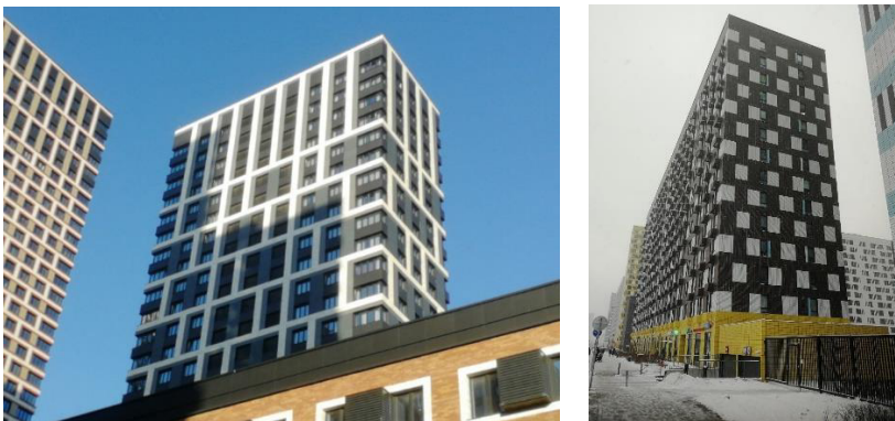
Fig. 10. “Level Amurskaya” (Moscow) and “Yaroslavsky” (Mytishchi).

And the last trend is due to the fact that some construction companies build absolutely lapidary boxes of residential buildings, which are devoid of any architectural details. Moving away from monotony is achieved by creating the optical illusions of facade three-dimensionality with the active introduction of black color, sometimes even in aggressive combinations, such as black and yellow, which is used to designate dangerous areas (Fig. 10).