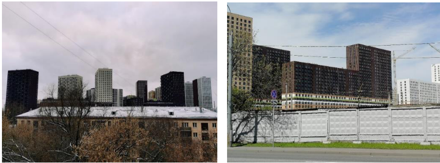
Fig. 7. “Beregovoy” and “Lyublinsky Park” Residential Complexes.

- black as the creation of a false facade (Fig. 11).