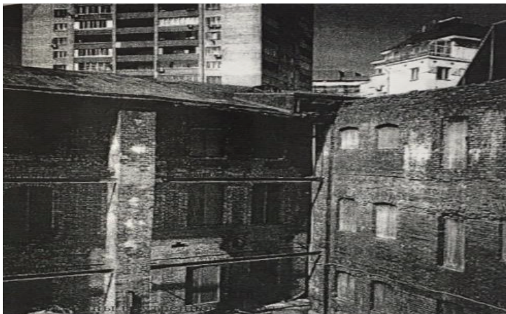
Fig. 1. General view of the brickwork of the external walls.