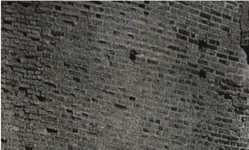
Fig. 3. Example of masonry destruction.

Low deterioration (less 15%) is caused by the defrosting, weathering and fire damages of walls material to depth no more than 5 mm, vertical and oblique cracks, crossing no more than two masonry rows.