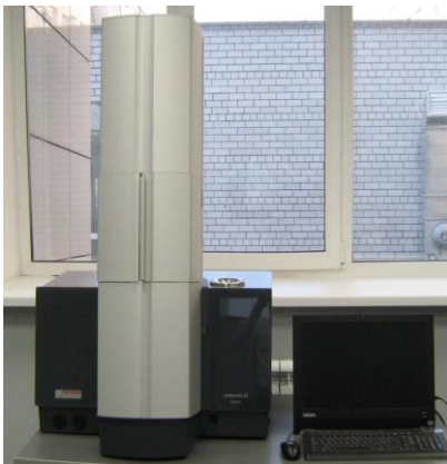
Fig. 1. General view of the Analysette-22 NanoTec laser analyzer (Fritsch, Germany).

The main part. For dust analysis, the method of granulometric analysis was used, the principle of which is based on the relationship between the size and speed of movement under the action of gravitational or centrifugal forces. The determination of the granulometric composition of the provided powder sample was carried out by laser diffraction, implemented on the Fritsch NanoTec "ANALISSETTE 22" laser particle analyzer (Fig. 1, 2) with the Fritsch Mas control control software package, in accordance with the requirements of ISO 13 320-2009 at the "Prof. Yu. M. Borisov Center for Collective Use".