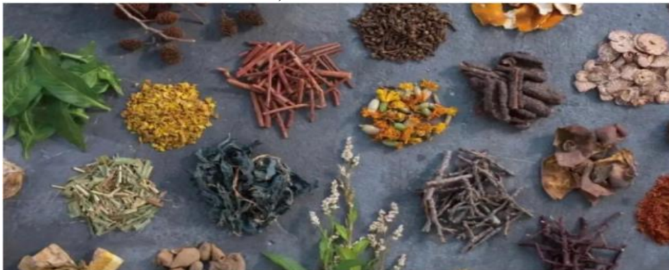
Fig.1 Some vegetable dyes

the improvement of people's awareness of social environmental protection, plant dyes have attracted more and more attention [1] . In addition, plant dyes have many functions, such as antibacterial [2] , in addition to dyeing properties. In this paper, the classification, identification, application and existing problems of vegetable dyes are reviewed.