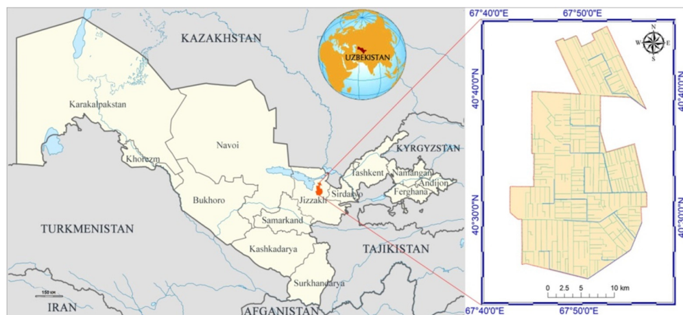
Fig. 1. Location map of the study area.

As a research area was chosen irrigated land of Arnasay district which is located in the north of the Jizzakh Region of Uzbekistan at the latitude of 40°25'N - 40°45'N, the longitude of 67°42'E - 67°57'E, absolute height 256 m above sea level (Figure 1). Its borders were formed in 1975 and have not changed until now. The total area of Arnasay district is 492.73 km 2 , wherein the 481.67 km 2 is used in agriculture. The relief of the region consists mainly of plains. The surface gradually rises from north and northwest to south and southeast. The study area has an extreme continental climate, with four seasons. The average temperature in January is from -1-5 degrees and up to 30 degrees in July. The average annual rainfall is 150-300 mm. Lake Aydar is located in the northern part of the Arnasay region. The soil is mostly Gray-brown, with partial salinity in the northeastern part.