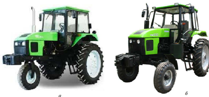
Fig. 1. Universal-tiller tractors with 3W2 (a) and 4W2 (b) wheel arrangements.

row-crop tractors of the TTZ brand with a traction class of 1.4 kN are used, they have different wheel arrangements (Figure 1), 3W2, and 4W2 [11, 12]. Consequently, the nature and magnitude of the impacts of these machines on the soil are different [13].