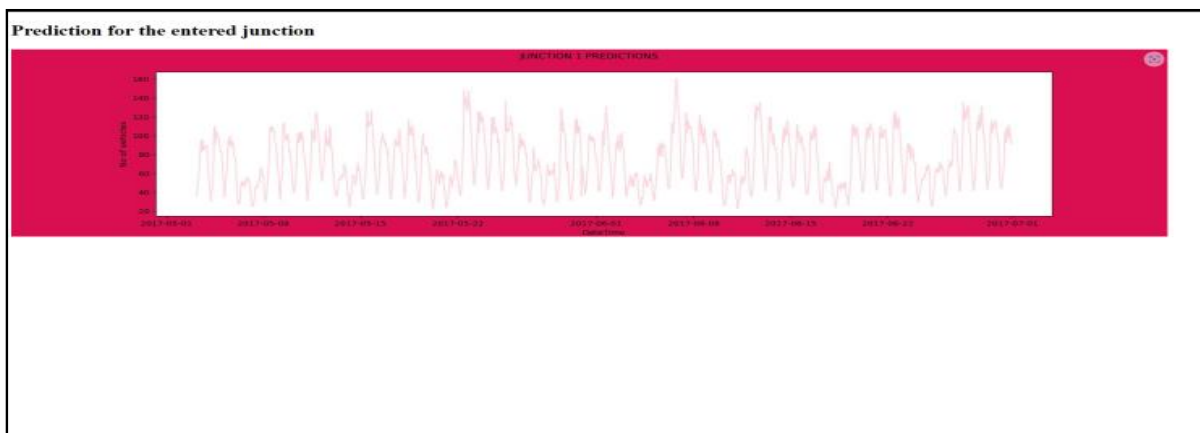
Fig.5. Screen shot of the webpage with the predicted output

Numerous ITS uses for traffic prediction utilising ML approaches are possible. Real-time traffic management is one use case. Traffic managers can make wise judgements about