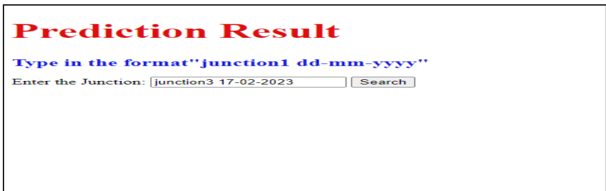
Fig.4. Screen shot of the webpage with the user input

The webpage which is developed using the Microsoft Visual Studio (VS code) using the languages namely python,HTML is used as the user interface to display the result which was predicted using the machine learning model developed. The webpage is designed with minimum buttons and it is very simple so that everybody can use it. Also the input is taken from the user from the webpage and then the required predicted result for the required junction is displayed as the output for the user in the webpage. The figure.5. shows the image of the webpage with the input from the user. The figure.5. shows the image of the webpage displaying the predicted result.