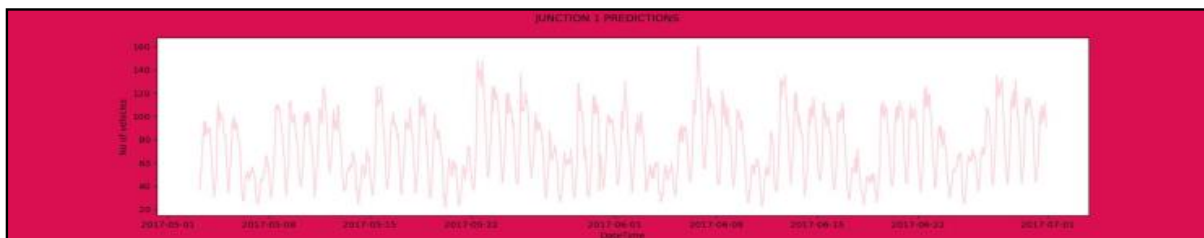
Fig.3. Screen shot of the predicted result

The webpage which is developed using the Microsoft Visual Studio (VS code) using the languages namely python,HTML is used as the user interface to display the result which was predicted using the machine learning model developed. The webpage is designed with minimum buttons and it is very simple so that everybody can use it. Also the input is taken from the user from the webpage and then the required predicted result for the required junction is displayed as the output for the user in the webpage. The figure.5. shows the image of the webpage with the input from the user. The figure.5. shows the image of the webpage displaying the predicted result.