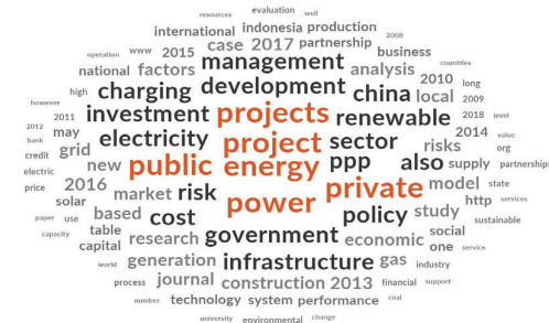
Fig. 3. Word cloud NVivo.

by analyzing scientific content with indications of high-frequency words [10]. The results provided by the software are as follows: