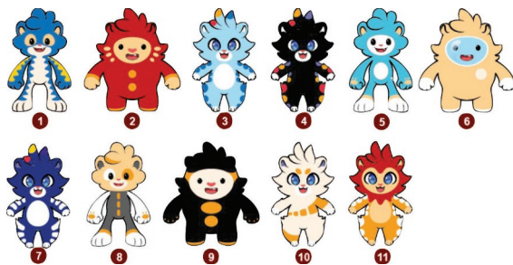
Figure 3. Preliminary survey-derived designs.

After narrowing the numerous color and texture alternatives to eight, which were then debated internally with the Team, it was agreed to condense the options into the three best options to choose pre-final mascot designs in the final survey, which would make it easier for responders to choose than selecting several possibilities.