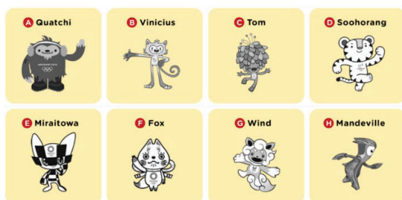
Figure 2. Eight Olympic mascots to choose from.

As a result, rather than displaying every available Olympic mascot, we chose only eight representing the most significant variations in terms of design principles and design characteristics such as shape, color, proportion, and tone, to assist respondents in making their choices. We tried to choose mascots representing diversity from the inception of the Olympic mascots in Grenoble 1968 through the mascots used at the Tokyo 2020 Olympics.