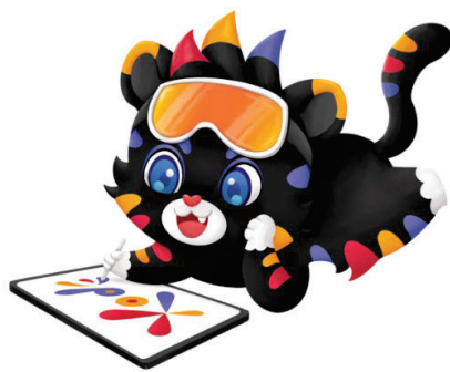
Figure 7. Final mascot in activity