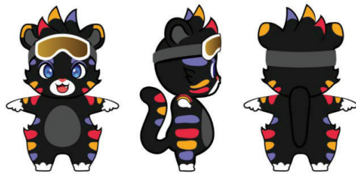
Figure 6. Final mascot designs

accessories. Now the mascot has been completed and is ready for use.