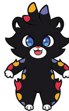
Figure 5. Pre-final mascot designs

According to the final survey results, mascot C was chosen as the most popular of the three mascots, predominantly black with red and blue accents, and was selected by 553 respondents, or 54.3 per cent of 1,018 respondents. Followed by three hundred thirty people voted for mascot A, which features the colors blue, white, and orange, whereas 135 people voted for mascot B, which features the colors red, cream, and orange. As a result of this, mascot C was chosen as the pre-final mascot in the final survey.