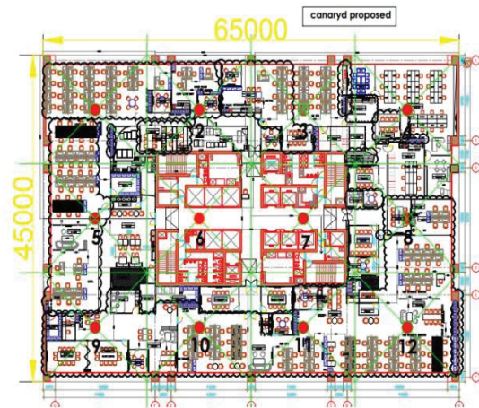
Fig. 3. 4th floor WTC 1 building.