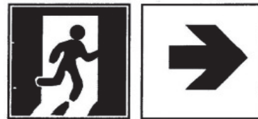
Fig. 1. Image and an exit symbol.

Since the emergency exit is very important as a means of egress, it is necessary to have a sign symbol indicating the direction of exit. The following is an example of an image and an exit symbol as shown in Figure 1.