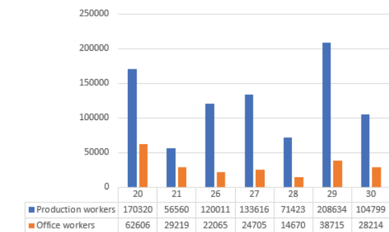
Fig. 3. Composition of Production workers versus office workers

Regarding the composition of production workers versus office workers, most workers in the high-tech industry (80%) are production workers. This indicates the company's growth, as the greater the market demand for high-tech industry companies' products, the more production workers are required. Because of the importance of having skilled production workers, businesses must focus on transforming quality human resources (HR). Figure 3 depicts detailed data.