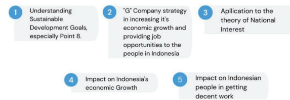
Fig. 1. Conceptual Framework

This happens because many passengers are more interested in using “G” application, which can only be ordered via cellphone without having to search on the roadside first. Thus, “G” Company also collaborated with “B” Company in 2017, and produced great results that “G” Company made it easy for passengers to get online taxis and drivers to get passengers. From the evidence of the work done by Google, it can be seen that Google has a big role in the success of the SDGs in Indonesia by providing decent jobs for the community. The research question raised was "What is the role of the “G” company in contributing to the achievement of the SDGs in Indonesia: decent work and economic growth?". All validity in this study were obtained from the official “G” Company website and also from journals and books that can be proven authentic.