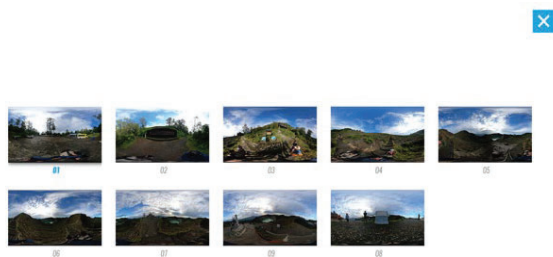
Fig.4. Option to teleport for virtual tour Flores expedition.

In this visual tour user menu in Figure 3, users can click on the points that have been provided to be able to move from one panorama to another in sequence to explore the tourist attraction. Then provided several hotspots where when users click the hotspot, they will get complete information about the object.