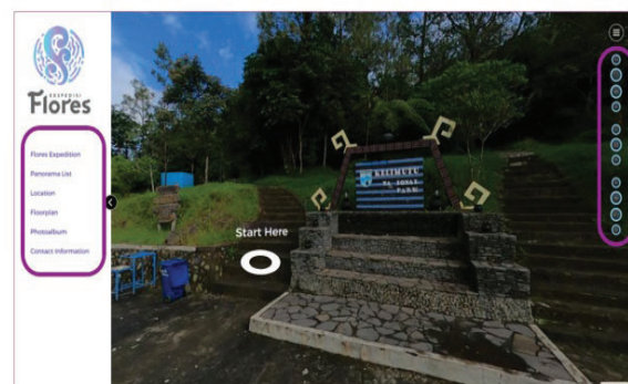
Fig.2. Visual interface for virtual tour Flores expedition.