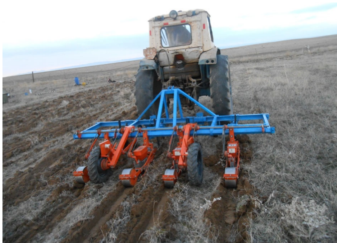
Fig. 2. Fragment of the combined tool operation.

The calculation of economic efficiency is based on the use of indicators of comparative tests of the unit, labor and monetary costs.