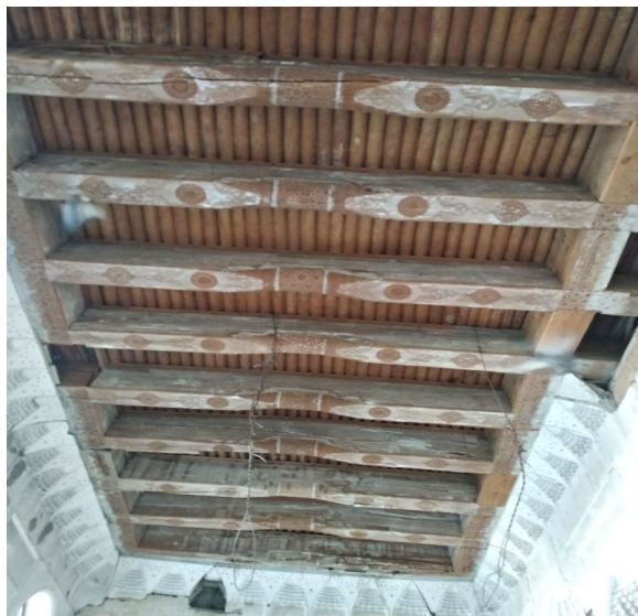
Fig. 6. A type of roofing with beams and beams.

Due to the fact that the region of Bukhara is located in the desert region of our Republic, the winds blow more than in other parts of the Republic, and there are small weak storms, so the houses are surrounded on all four sides. It consisted of dwellings with one courtyard, closed on all four sides, consisting of two, sometimes three courtyards (Figure 6).