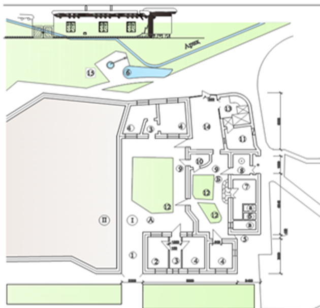
Fig. 1. The scheme of the location map of Grandfather Yunus's house in the area.

Grandfather Yunus' house was built in 1930s. The house is located in the village of Karakulonchi, which belongs to the "Jigachi" neighborhood of the Karakol district. The house is mainly made of straw (Figure 2). The frame of the hotel and living rooms attached to the hotel is made of wood and planks by the "Chopkori" method (Figures 3,4) [7-9].