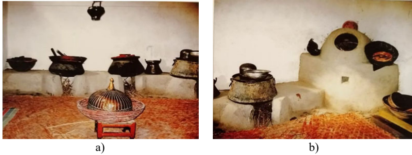
Fig. 5. Furnace interior; a) furnaces; b) oven.