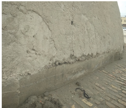
Fig. 2. A wall made of straw.