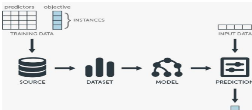
Fig. 1. System Architecture.