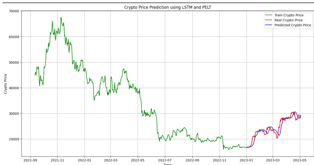
Fig.4: Plot between Time and Cryptocurrency Prices after modeling using LSTM+PELT.

After the PELT algorithm is applied the visualized actual vs predicted prices plot is shown as in Fig 4. Fig 4 shows a plot between time and bitcoin price where 80% of the collected data is used for training and 20% of data is tested using the LSTM+PELT model where the real and predicted prices are shown in red and blue color curves respectively. From the plots Fig.2 and Fig.4, there is a slight improvement in the distance between real and predicted price curves which visually shows that the LSTM+PELT model in Fig.4 has higher accuracy in predicting the price value compared to only using the LSTM model in Fig.2.