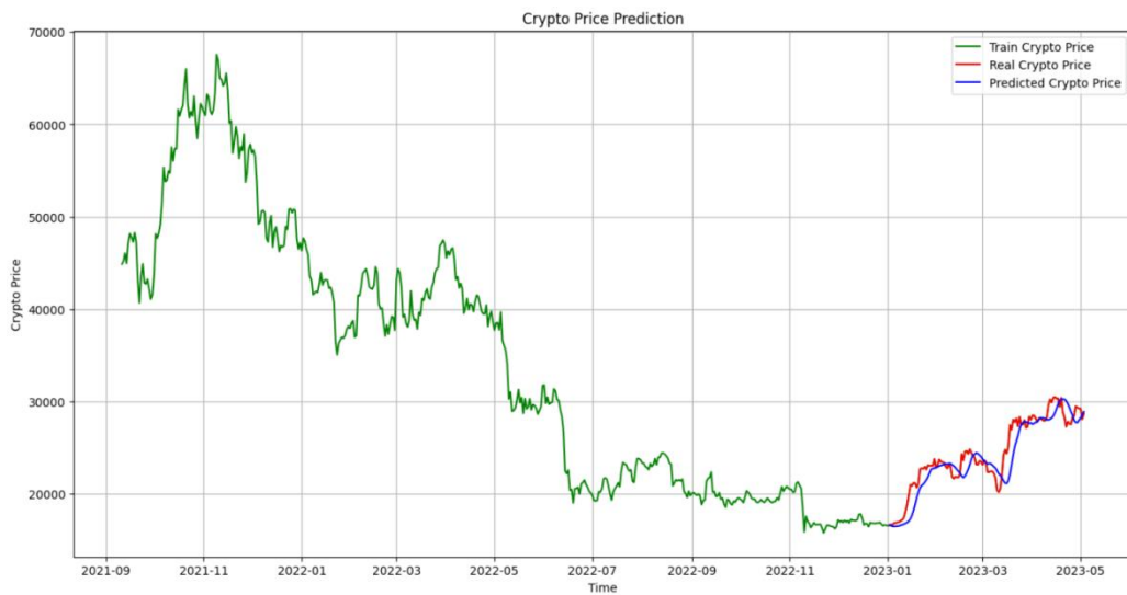
Fig.2: Plot of Bitcoin price and Time with LSTM algorithm

Based on the input symbol the Historical time series data of the particular is collected and The CPD technique using the PELT algorithm is then implemented on the LSTM network. Change points are detected by the PELT algorithm which is shown in Fig 3. is applied after the data is preprocessed and scaled. Fig.2 shows a plot between time and bitcoin price where 80% of the collected data is used for training and 20% of data is tested using the LSTM algorithm where the real and predicted prices are shown in red and blue color curves respectively.