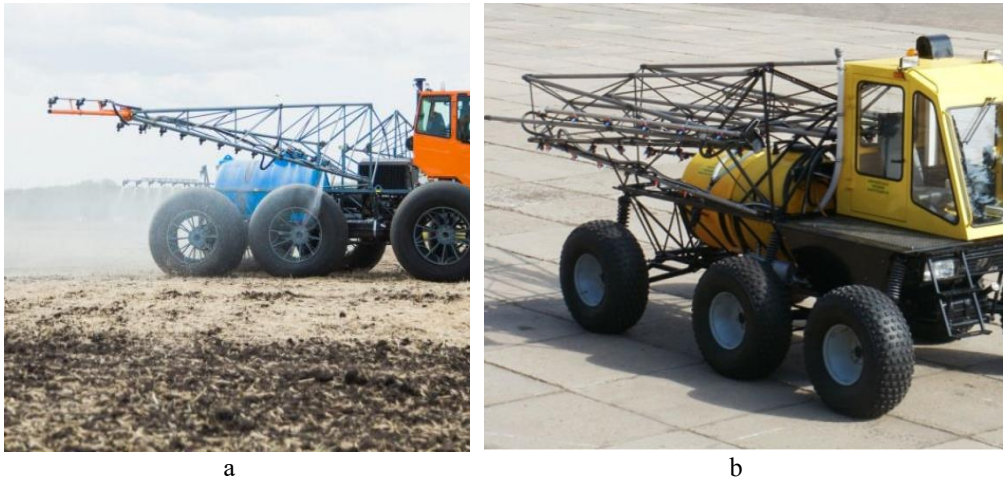
Fig. 2. Compared parameters of TUMAN-1 2a and RUBIN 2b units

A new approach in the method of choosing the best sprinkler design is the method of calculating the dependencies of the coefficients of the estimated parameters when translating them from actual to dimensionless to determine the desirability function.