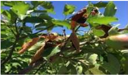
Late blight in Potato [33]