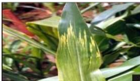
Downy mildew in Maize [28]