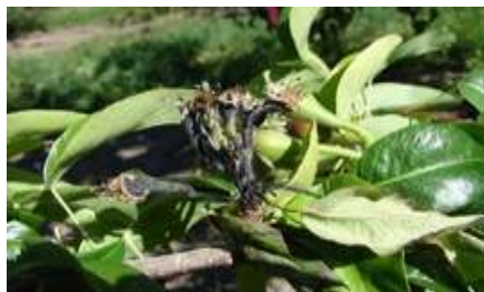
Fire blight in Pear [29]