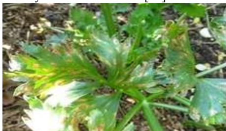
Early blight in Celery [31]