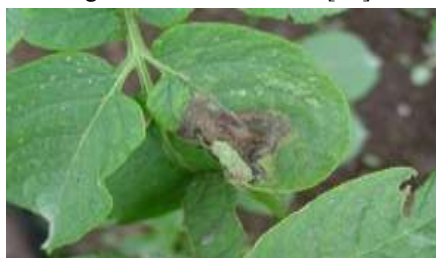
Late blight in Potato [33]