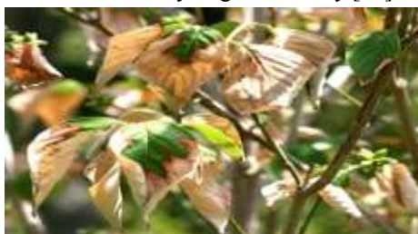
Leaf blight in Coronus Florida [32]