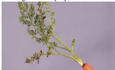
Leaf blight in Carrot cultivars [30]