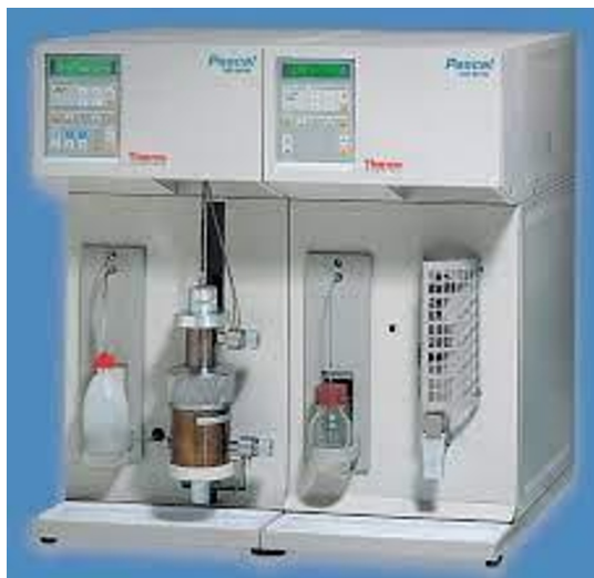
Fig. 1. "Thermo Scientific Pascal 240 EVO"

The porous structure of aerated concrete blocks was studied with the help of "Thermo Scientific Pascal 240 EVO" mercury porosimeter (Figure 1).