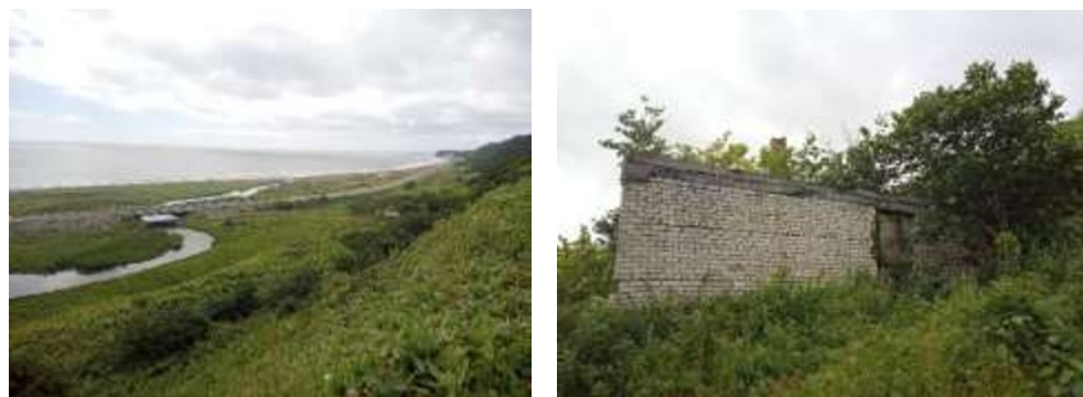
Fig. 1. Remains of the border guard buildings at the site of the former village of Sernovodsk.

According to oral reports by A.P. Milichkin, an old local resident and inspector of the Kurilsky Nature Reserve, it is known that the village of Sernovodsk was situated on the of Sernovodsk Isthmus in the vicinity of Glukhoye Lake until the end of the 1960s. The lake was used by the locals for bathing, and had no fish (no large-scale fishing was performed). In the vicinity of Glukhoye Lake, there were a number of areas of thermal mud that supposedly gave name to the isthmus and the village. Earlier, during the Japanese development of the Southern Kuril Islands, a Japanese fishing village Tofutsu was located on the site of the village of Sernovodsk. There has been a Japanese cemetery around Glukhoye Lake ever since. At the end of the 1960s, the village of Sernovodsk (Figure 1) was evicted and a border outpost and fortifications were built in its place, as well as in its surroundings. The outpost was closed in the early 1990s and is now a ruin. Since then, Glukhoye Lake has had no economic importance.