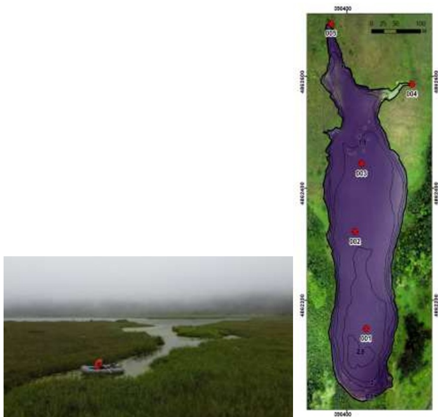
Fig. 3. Hydrological-hydrochemical synchronous survey on Glukhoye Lake (left) and the location of the survey points (marked with red stars) superimposed on the UAV image (right).

HANNA HI-98129 was used to measure pH, conductivity, salinity and temperature; measurements were taken in a specially selected sample taken using a shaking bathometer [5].