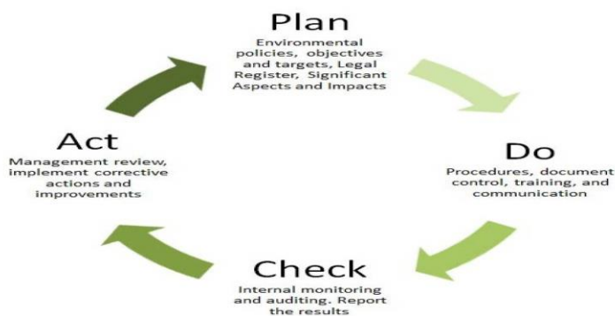
Figure 2 : Environmental Management System

Environmental management in public administration consists of integrating environmental concerns into the policies, practices and processes of public administration. It aims to promote sustainability, reduce the environmental impact of administrative activities and ensure responsible management of natural resources. Public administrations can develop and implement environmental policies that guide their actions and decisions. These policies may include commitments to reduce greenhouse gas emissions, promote energy efficiency, protect biodiversity, and manage waste. Environmental considerations must be integrated