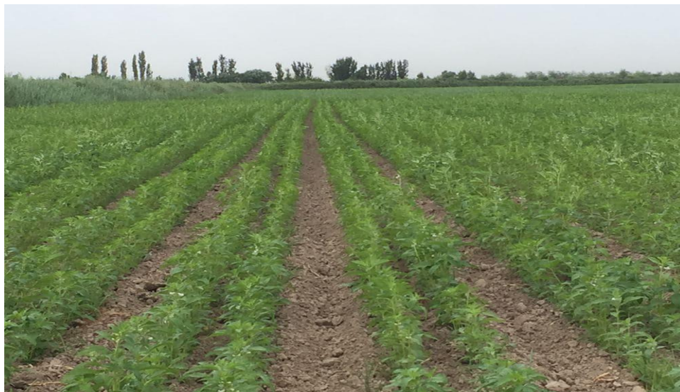
Figure 2. Kiva variety.

Another advantage of the " Kiva" variety of sesame compared to other varieties is the shorter growing period of 10-12 days. In the climatic conditions of the Khorezm region, the correct determination of planting dates is one of the most important factors in growing a high yield of sesame. Based on the results of our research, taking into account the recent short-term cold days that may occur in the Khorezm region, we determined that the optimal planting period for growing high-quality and exportable sesame in the local climate is May 1-10.