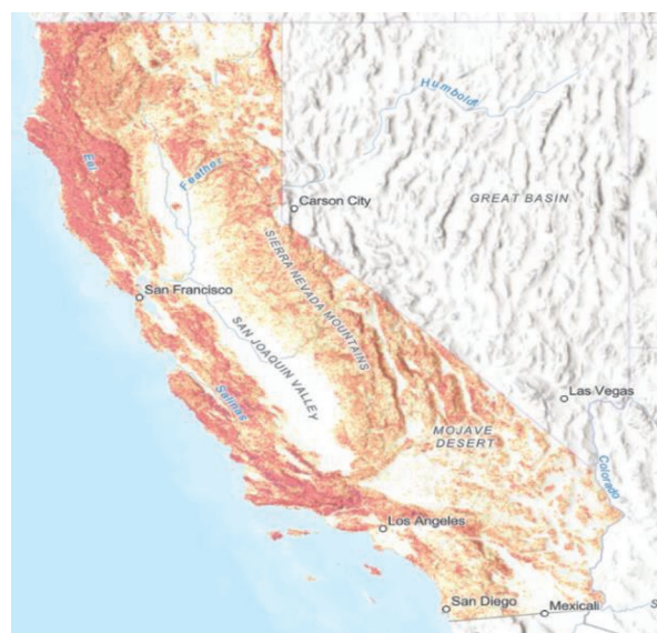
Fig. 2. California deep landslide Susceptibility.

landslides based on the location of past landslides, the location and relative strength of rock units, and the steepness of the slope (see Figure 2). The darker the red shadows are, the more susceptible the land is to landslides. Basically, the most susceptible areas are faults on the west coast. Mountainous regions in the eastern California, including Mount Pass, the richest mine in the United States for rare earth minerals, are also highly prone to deep landslides. Based on the map in Figure 3, which draws a picture of the distribution of Native American populations in the United States, and Figure 2, polluted waste and environmental damages (deep landslides) are disproportionately located in Native American communities.