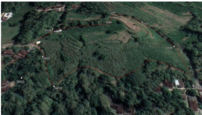
Fig.1. Land boundary.

The tourist destination area of Semoyo Village, whose landscape design is planned, has a land area of 2.1 ha.