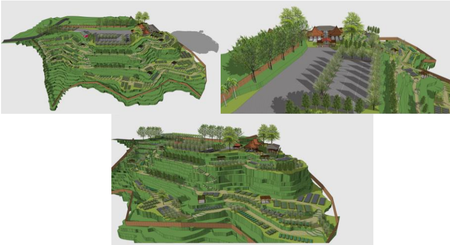
Fig.4. Landscape Design of the Semoyo Tourism Village.